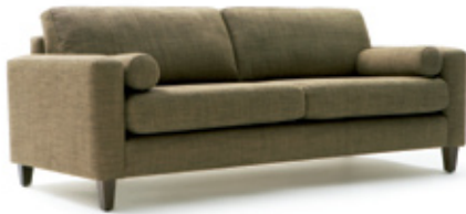
Clockwise from top: PR169DL, PR91DR modular assembly; PR208/2 sofa. Previous: PR91DR, PR169DL modular assembly.